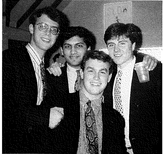
Zetes prepare for the winter formal.