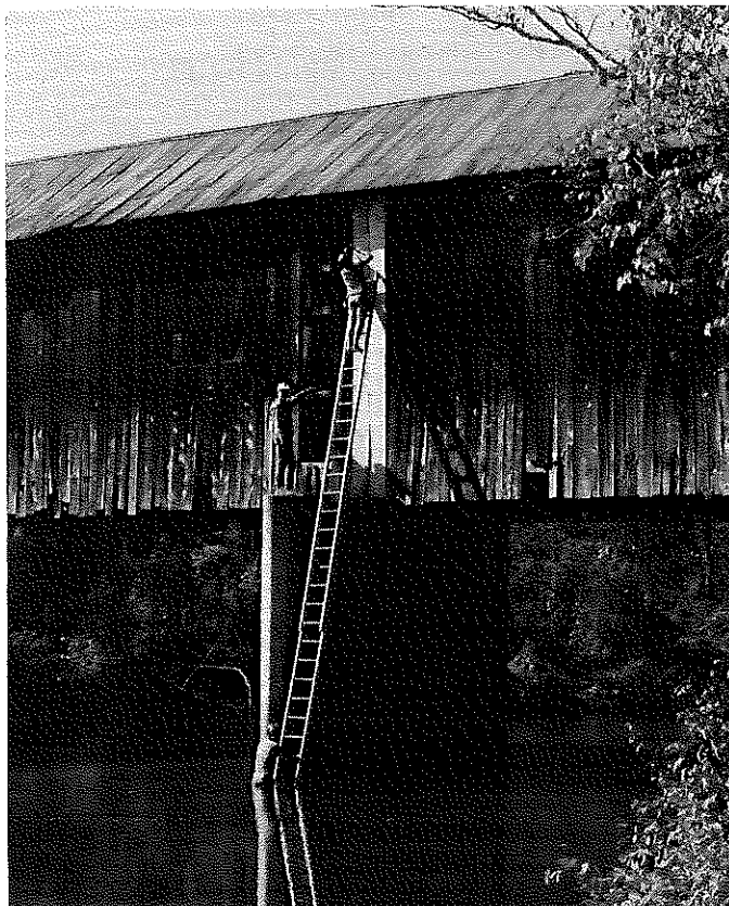
Zeta brothers helping to repair historic Thetford Bridge as part of a community service project, fall '87.