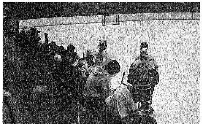
Between periods at Zeta hockey, winter '88.