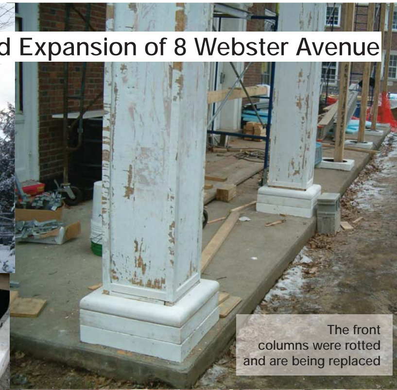
The front columns were rotted and are being replaced