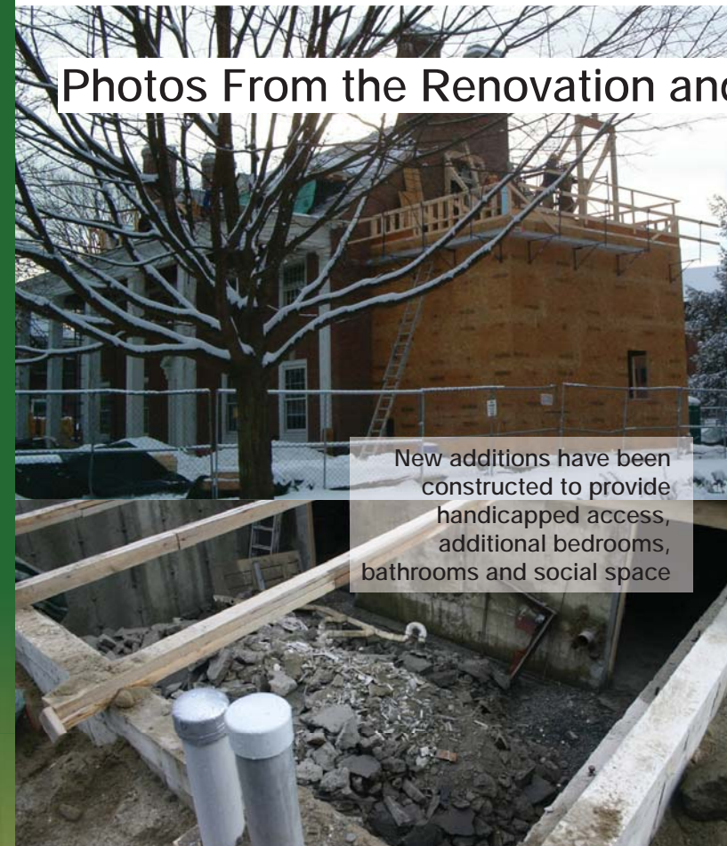
New additions have been constructed to provide handicapped access, additional bedrooms, bathrooms and social space