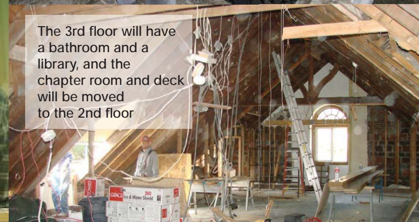
The 3rd floor will have a bathroom and a library, and the chapter room and deck will be moved to the 2nd floor