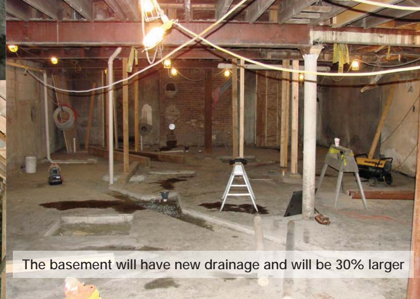
The basement will have new drainage and will be 30% larger