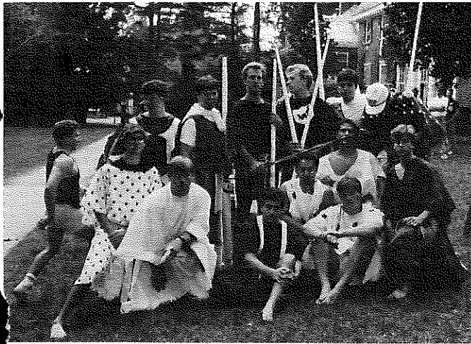
Camelot winners '88: House of Walter.