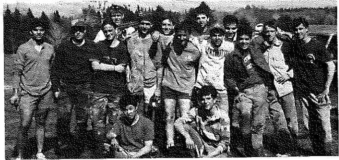
Survival game, spring '88.